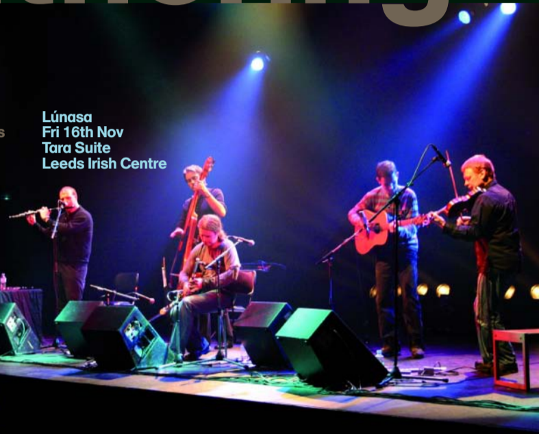
Lúnasa Fri 16th Nov Tara Suite Leeds Irish Centre