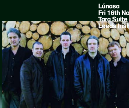
Lúnasa Fri 16th Nov Tara Suite Leeds Irish Centre